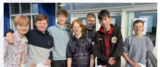
Broad smiles as Yr11 celebrate their GCSE results!