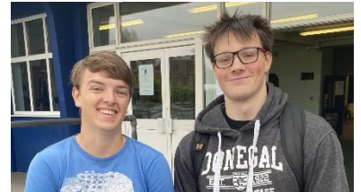
35% of Yr13 students gained at least 3 A*/A

Start of September Term 2023: It is a pleasure to write to you at the start of a new year at Glantaf as we look forward to welcome pupils back to school. I also hope you have had a restful and enjoyable summer break. Yr7 and 12 will start term on Tuesday 5th of September with all other pupils starting the new term on Wednesday 6th of September.