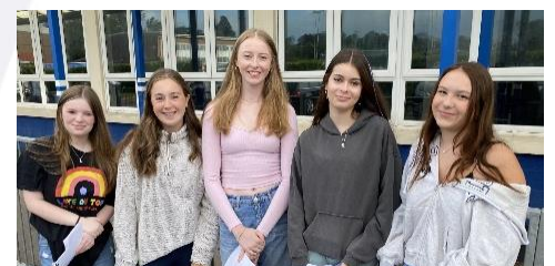
GCSE success for Yr 11!

School transport: You should have received confirmation of bus and taxi routes if your child is eligible for free school transport. Cardiff Bus timetable is also available for the 615 service here: School Services from September 2023 - Cardiff Bus Bus passes will be distributed to pupils at the start of term and will be required for all journeys from Mon 11th Sept.